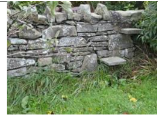
(above) traditional gritstone dry stone wall; (below) overgrown hedge along east of field