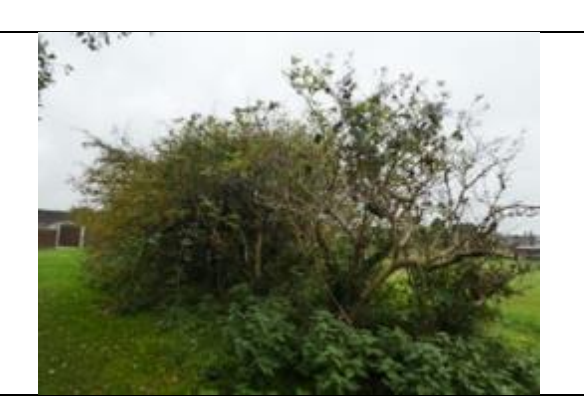
These images show the rich diversity of habitat provided by the overgrown hedges with trees and undergrowth of nettles and other local wild flowers. Rose hips, hawthorn berries, crabapple and other berries attract birds. Traditional and undisturbed dry stone walls host invertebrates.

One resident added a comment on the attractiveness of the wild hedgerows for hedgehogs: