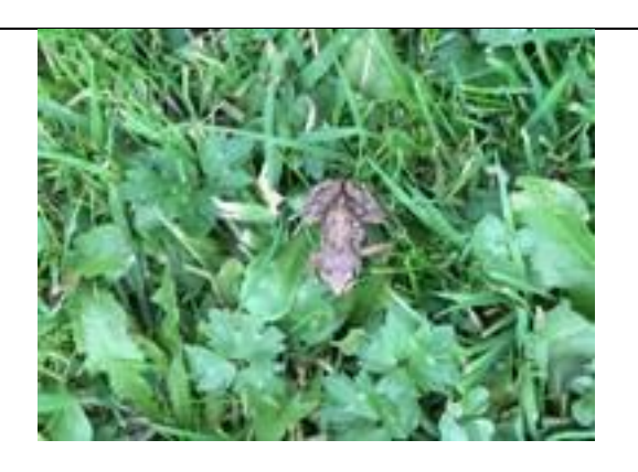
(above) image taken by parent and found by children exploring the overgrown edges of Station field for wildlife