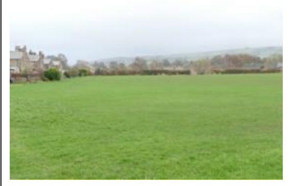
(above) view to the east; (below) to Caton moor unfortunately in mist.

The location of Station field provides panoramic views over the countryside of the local area of the Forest of Bowland AONB, and an especially fine long distance view to Caton Moor. Because of the size of the field; the stone walls; vernacular materials used for the buildings to the north and west; the dense hedgerow with trees to the east, the surrounding buildings do not detract from the views beyond. The views are important for making this a special location for the community events that take place here.