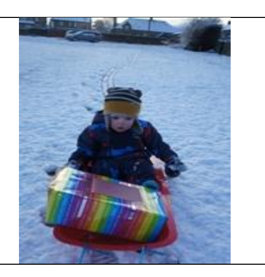
30 Hornby Road Caton Lancaster LA2 9QS