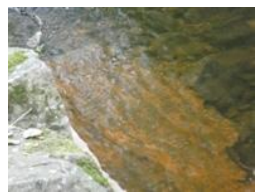
Under the waters the outline of corrugated iron used for den construction