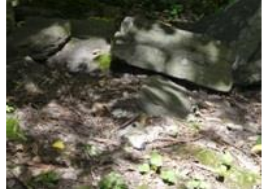
Full of natural materials for constructing hideouts