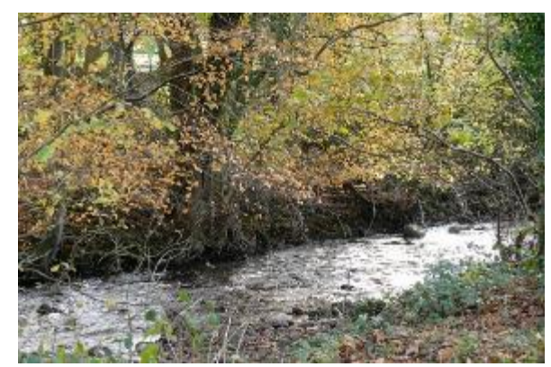
Path leading to Artlebeck

The Parish Woodland is a unique place for informal recreation for older young people: