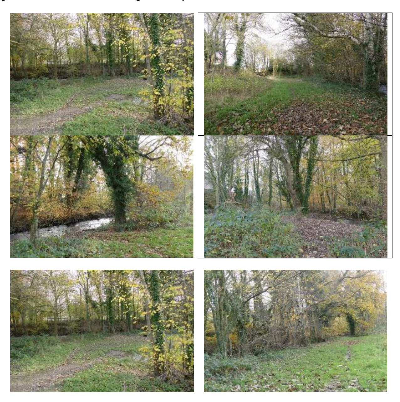
Link to google photos <a href="https://photos.google.com/album/AF1QipM2O9YXtRhrQ3kBkFW7KL2R_j6IwUlspkqsk2Qy">https://photos.google.com/album/AF1QipM2O9YXtRhrQ3kBkFW7KL2R_j6IwUlspkqsk2Qy</a>

A well used path leads along the Artlebeck bank in both directions for the length of the Parish Woodland, with other paths leading to it from the path along the middle of the woodland and