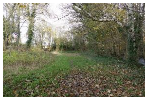
The Parish Woodland lies below the level of the adjacent residential area