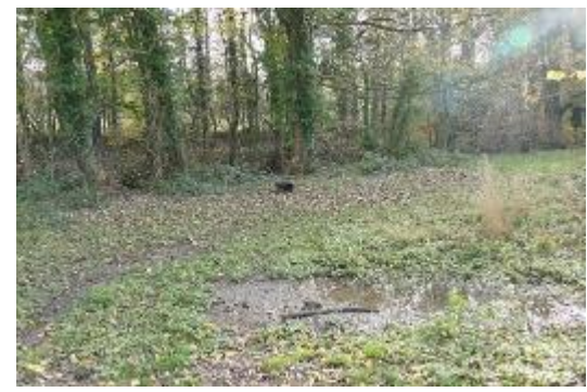
What is left of the bmx ramp - what message does this have for older young people?