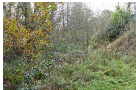
A natural hideaway