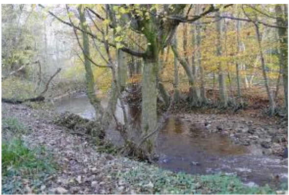
The well worn pattern of paths throughout the woodland and along Artlebeck, provide evidence of regular and continued use throughout the year.