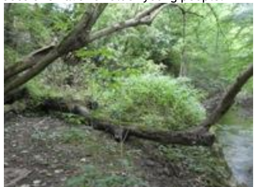
Natural climbing and balance challenges

The seclusion has made the parish woodland exceptionally attractive to older young people seeking an area where they could be undisturbed by adults, and which they could make their own, and create their own structures and activities to enjoy. This age group has, in Caton with Littledale parish, met with remorseless antipathy by older adults, who unlike younger people, do not hesitate to complain to the Parish Council if young people are active near their properties. Unusually, these complaints are the main source of evidence to demonstrate that the parish woodland has for many decades been considered very special and valuable by older young people. The young people themselves have shown, by their actions and their initiatives in using the woodland, the special value of the parish woodland.