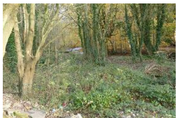
Rare evidence of litter spot the red packet!

1. Easy access, the lack of cultivation and low lying position of the woodland enabled unwanted materials such as corrugated iron sheets and other waste building materials to be taken or just left there, enabling young people to construct dens, some quite sophisticated, by and for young people (in the 1980's and 90's). A resident complained on grounds of mess, to Caton with Littledale Parish Council, which asked Lancaster District Council to remove the materials used which, although sympathetic towards older young people's needs, they reluctantly did. There is still evidence from this period, from corrugated iron sheeting in the water of Artlebeck.