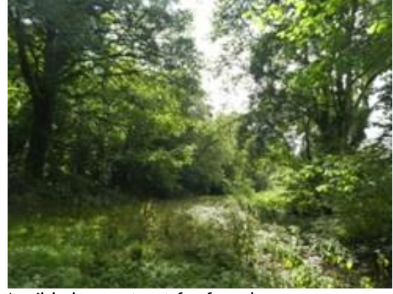
A wild place yet not far from home