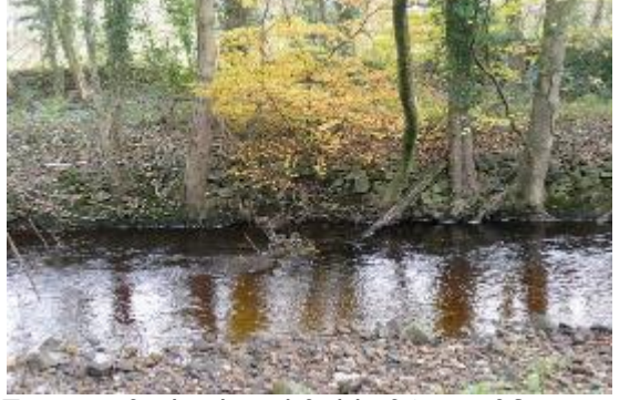
Roots exposed by storm Desmond