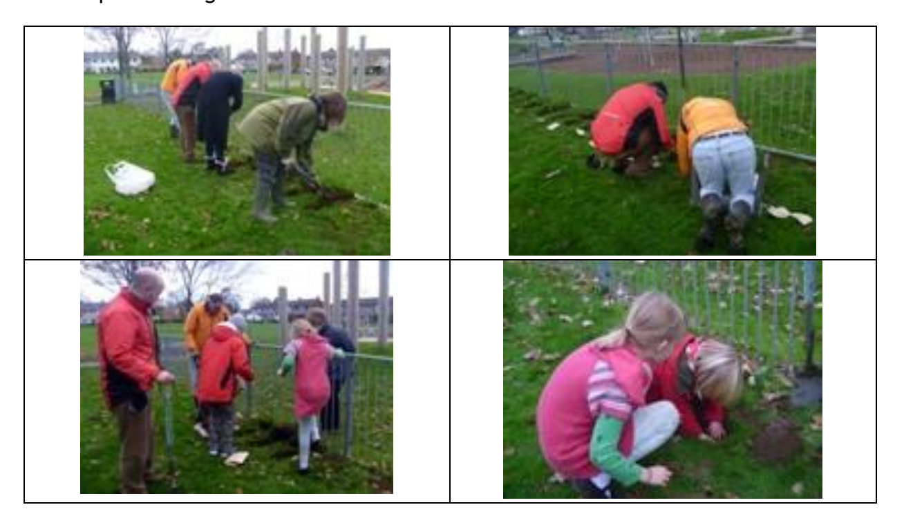
Contribution to community sustainability

Fell View, Caton Community School Field, and Station Field each provide: